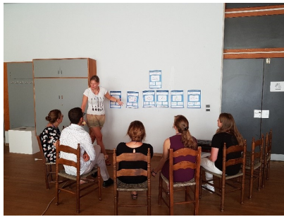
The early career researchers explaining their research projects.