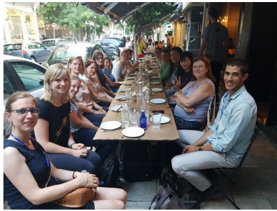
Social dinner of the Early Career Researcher.

To conclude the ECRM, there was a social dinner on the 18th of July to get to know each other in an informal way.