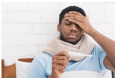
A fever of 100.4° or higher